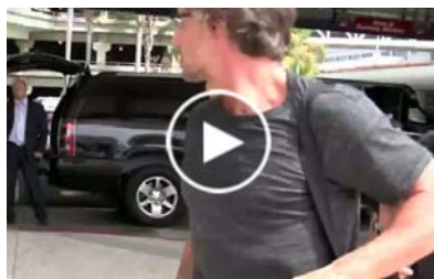
Britney Spears' Fiancée Granted Co-Conservatorship Apr. 26, 2012