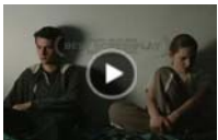
Trailer: 'The Forgiveness of Blood' Feb 23, 2012