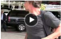
Britney Spears' Fiancée Granted Co-Conservat... Apr 26, 2012