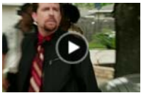
Trailer: 'Jeff Who Lives At Home' Feb 23, 2012