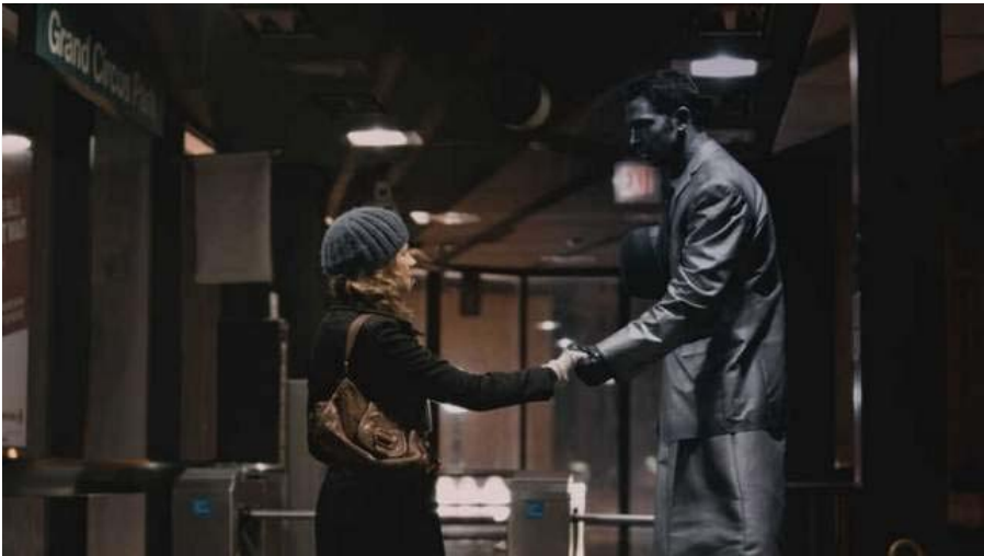
Jenna Fischer and Chris Messina get to know one another in "The Giant Mechanical Man." Messina plays the title character, a silver-painted street performer, who enjoys performing near Detroit's People Mover stations.